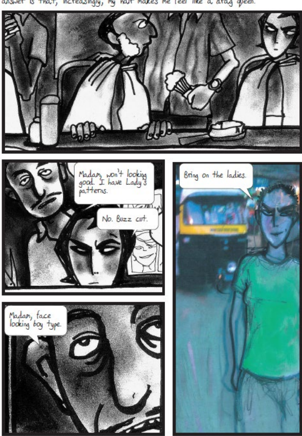
Figure 3. 'Towards graphic androgyny'. Excerpted with permission from Kari (p. 107) by Amruta Patil. © Amruta Patil.

I consider lying to the man that I am auditioning for a film about the Indian Army - people like being aides to celluloid history - but I am too lazy to begin As it is, scissorman is neither happy nor convinced. Why would someone choose to be a shorn sheep when she could be earth mother or rumpled siren instead? The answer is that, increasingly, my hair makes me feel like a drag gueen.