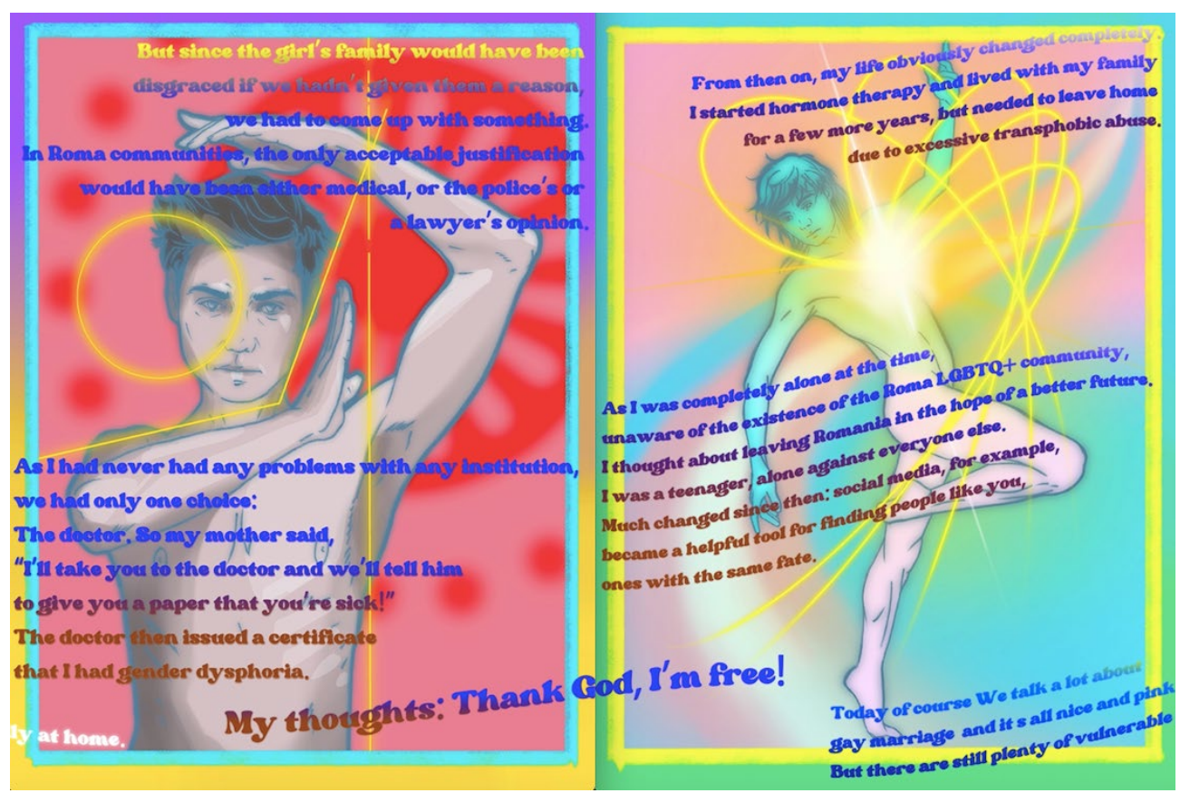
Figure 2. Stella's story (an excerpt from the graphic novel) (2022). Roland Korponovics/QR Stock Collective.

transphobia (Figure 2). In the six months between the two workshops, additional data were generated through four photo elicitation interviews. In the photo elicitation interviews, which I analyse in the empirical part below, the research participants discussed the visual self-representations produced during the first visual methods workshop in March 2019, as well as photographs of their own choice.