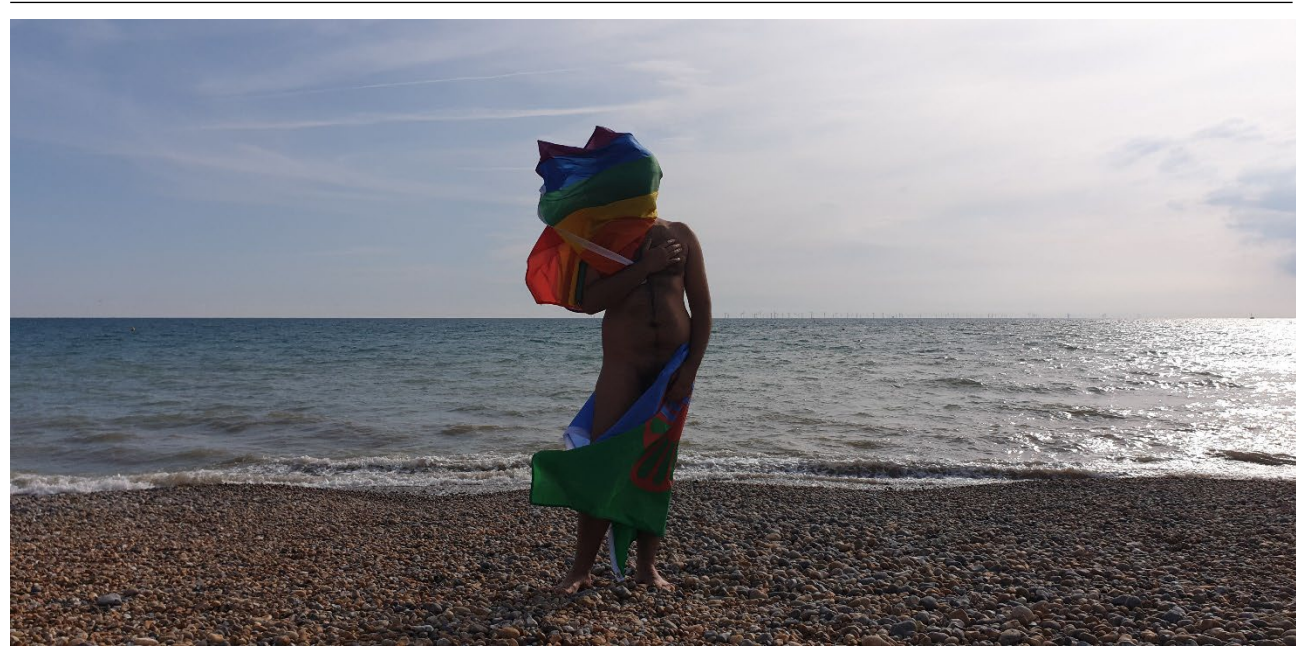
Figure 3. Nude. Queer Roma on the beach (2019).

in images portraying poverty, social unrest, war and disasters. However, Romani children, who tend to prevail in photographs portraying Roma, are routinely associated with a lack of parental concern or safeguarding when shown in 'clan and tribe-type structures' (Tremlett, 2017: 728). Such Western, ethnocentric, white-, cis- and heteronormative perspectives and highly romanticised view of cultures often entail a particular set of ideas and assumptions regarding social organisation, which are used to frame the entire world (Ledin and Machin, 2018: 44).