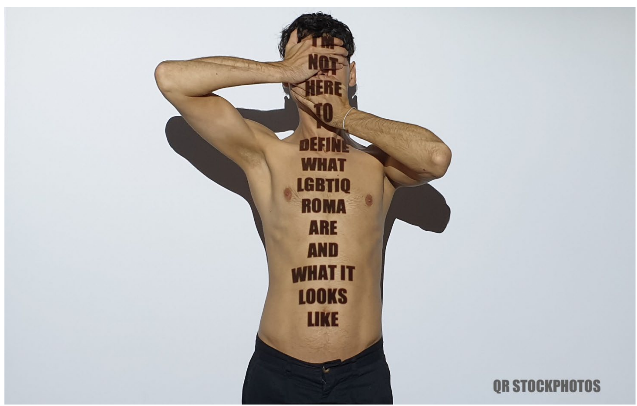
Figure 9. On my skin 1 (2019). QR Stock Collective.

to see highly individualised representations of Roma that do not categorise – or essentialise – them in biological or cultural terms.