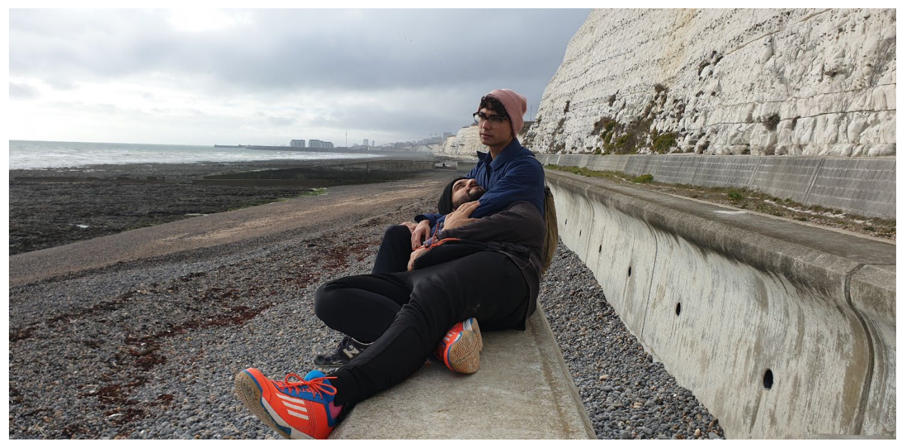
Figure 8. Everyday life. Queer Roma on the beach (2019). QR Stock Collective.

by the bright saturated light. The visual self-representation in Figure 8 was produced outdoors, on the British seaside. We see a young gay couple in a pensive mood, sitting on an elevated wall (coastal groyne) on a pebble beach, next to an undercliff walk, both unfolding into the background. One of the protagonists is sitting up, holding his partner who is lying down. The muted, moderate colours of the setting, complemented by the hues of the overcast sky, accentuate the intimate atmosphere of the scene.