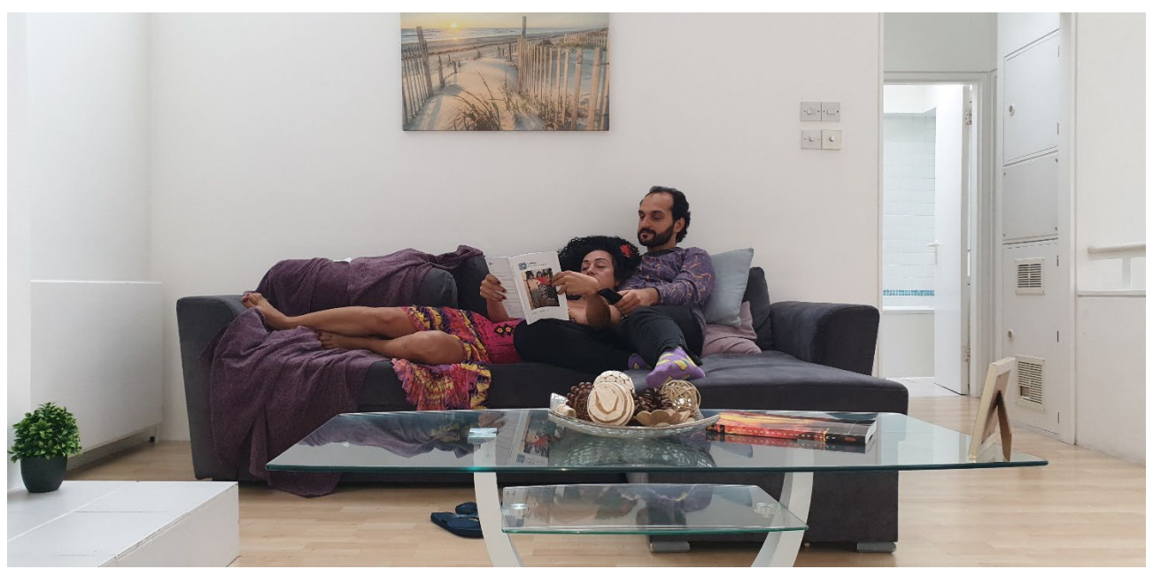
Figure 7. Everyday life. Queer Roma at home (2019).