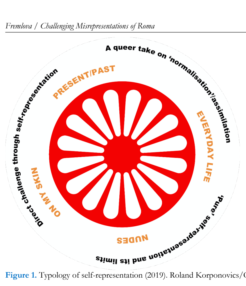
Figure 1. Typology of self-representation (2019). Roland Korponovics/QR Stock Collective.

For each of the 70 existing visual representations (and later the self-representations created by the queer Romani participants), I considered several aspects: genre, composition, the people portrayed, colours, objects, settings, and the positioning of the (intended) spectator. I also considered what each representation depicts (denotation) and alludes to (connotation); the spectator's cultural (this connotation is present in studium ) participation in the figures, the faces, the gestures, the settings, the actions; and punctum: 'this element that rises from the scene, shoots out of it like an arrow and pierces me' (Barthes, 1977, 1981: 26). For coding purposes, I used computer-assisted qualitative data analysis software (CAQDAS) NVivo 11. One of its features enables the researcher to process the labelling of the content of each photograph, which can then be generated into broader themes. Initial coding and categorisation helped me to determine key preset, as well as recurrent and re-emergent constructs, patterns and themes, which I revised throughout the research process (Willms et al., 1990; Miles and Huberman, 1994).