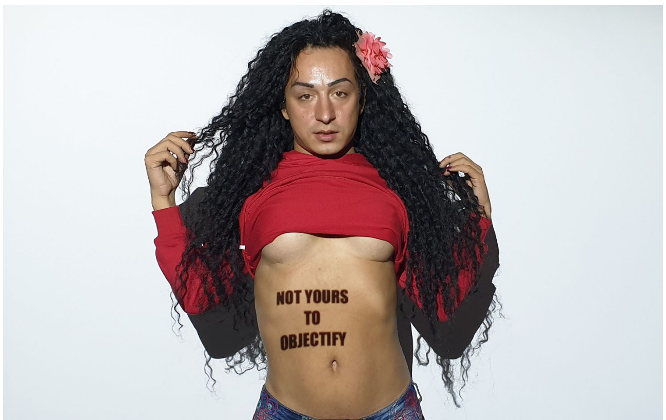
Figure 10. On my skin 2 (2019). QR Stock Collective.

Visual self-representations with white space as the setting came to constitute a specific type of decontextualised photographic representations. In Figure 9 and Figure 10 , the protagonists and the writing projected onto their bodies play a greater symbolic role. Through these close-ups, the decontextualised images not only foreground the queer Romani protagonists and their agency as individuals; they are also used to symbolise the idea that these self-representations are highly personal. Therefore, as such, they cannot, and do not represent or define the LGBTIQ Roma 'community' as a whole, despite the frequent assumption that members of non-dominant groups such as ethnic/'racial', sexual and gender identity minorities will be 'everything for everyone'. The limits of self-representation and its use lie precisely in the notion that they do not speak for all queer Roma.