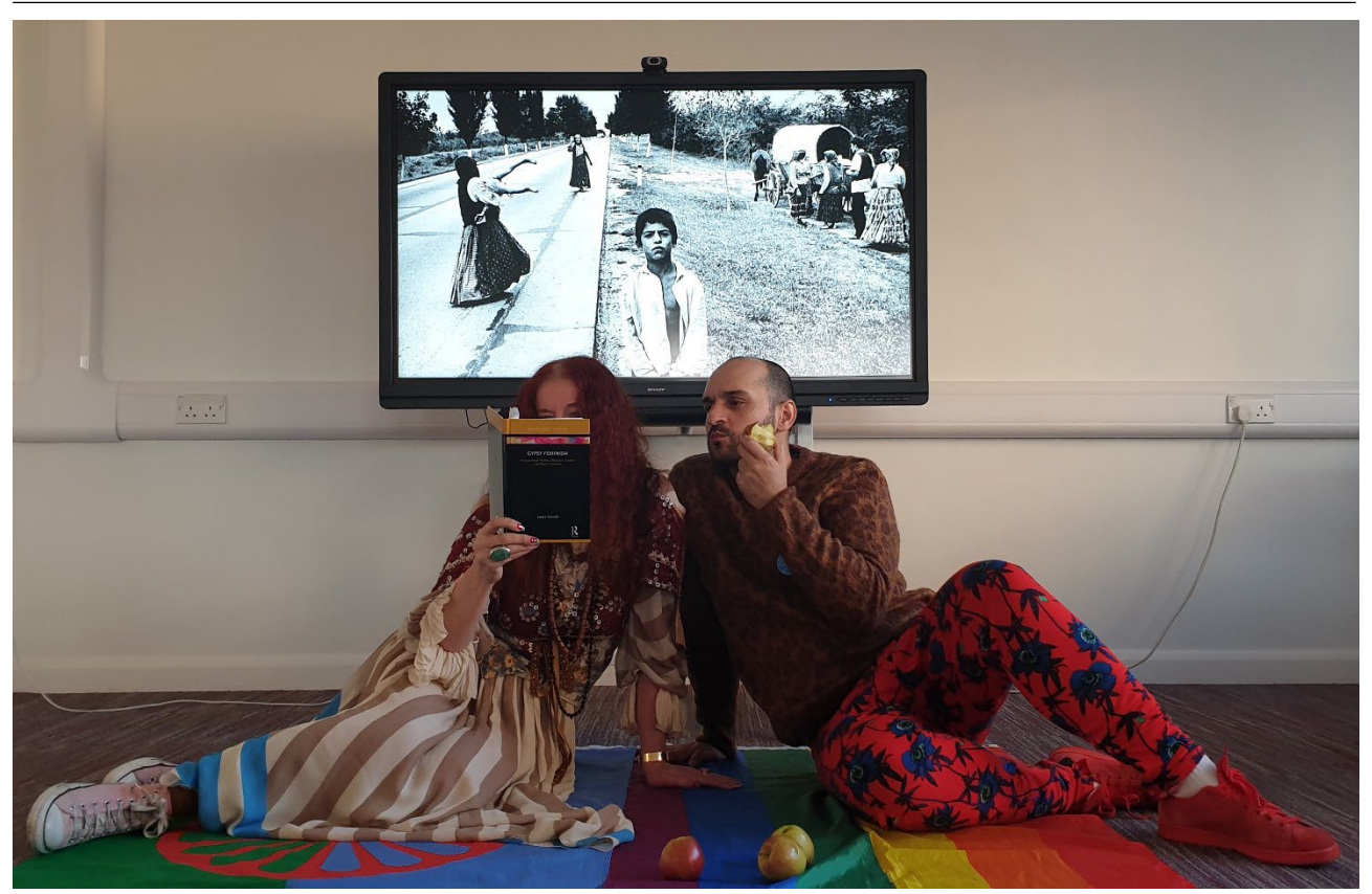
Figure 5. Present vs. past. Queer Roma with Josef Koudelka's photo in background (2019).

flags. The woman (D) reads a book; the man (L) eats an apple and observes her. There are apples in front of him. The man's clothes are colourful, while the colours of the woman's dress are more mellow and toned down.