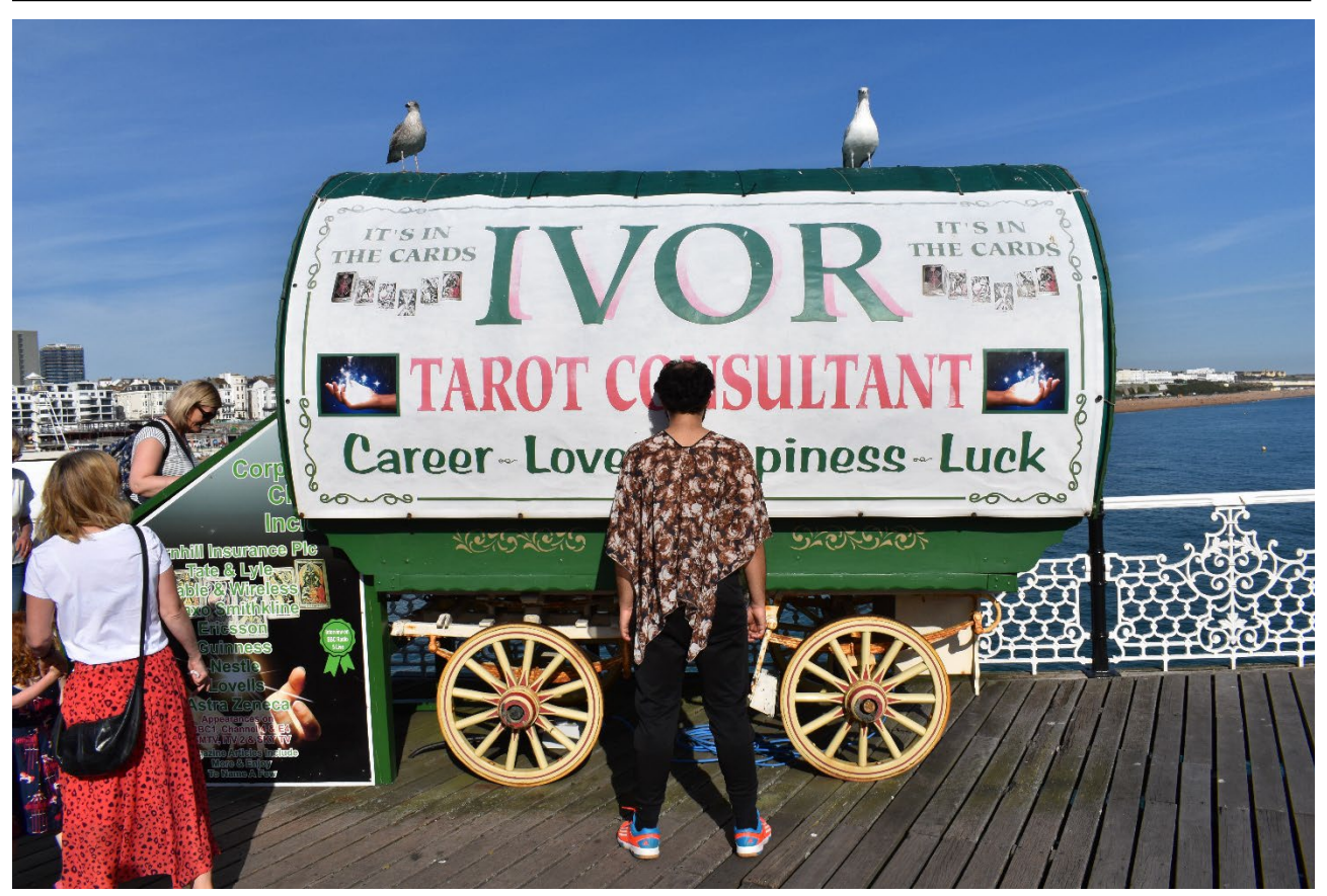
Figure 6. Present vs. past. Queer Roma facing a Gypsy trailer (2019).

stereotypical 'myth' on the one hand and the queer Roma person's highly heterogenous lived experience in the 21st century on the other.