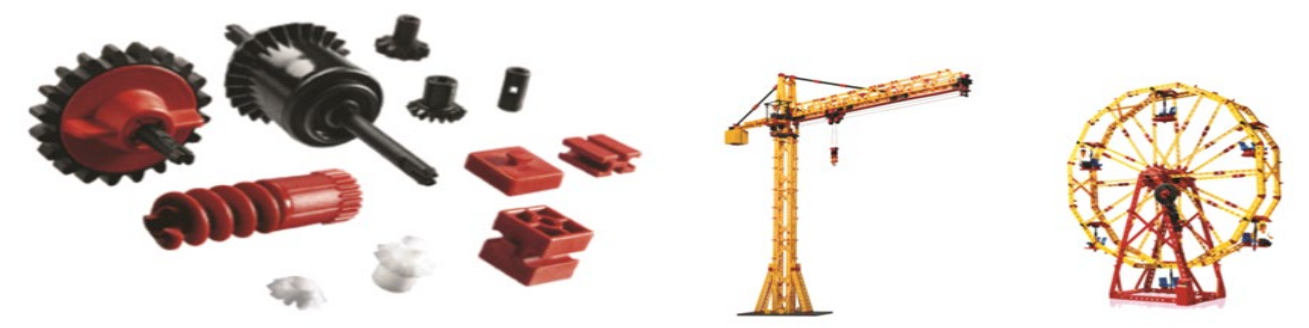
Figure 1. Some parts of Fischertechnik engineering sets