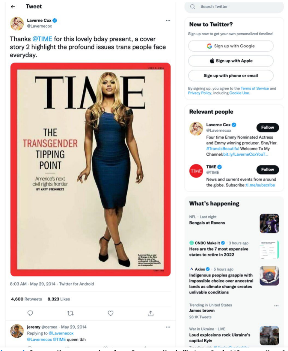
Figure 1. Lavern Cox, screenshot from Laverne Cox's Twitter feed, @LaverneCox, May 29, 2014.